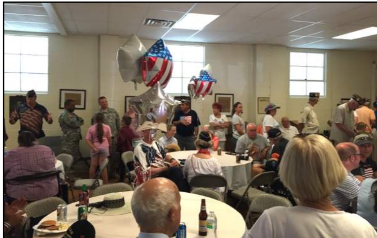
Lunch is Served!