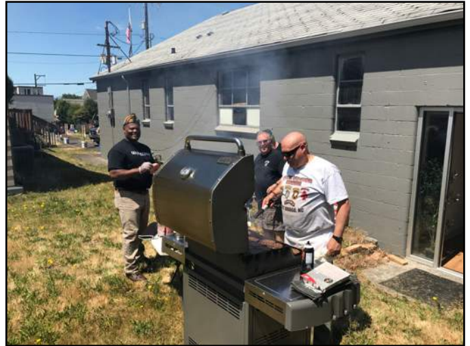
Three expert grillmasters hard at work on the barbecue