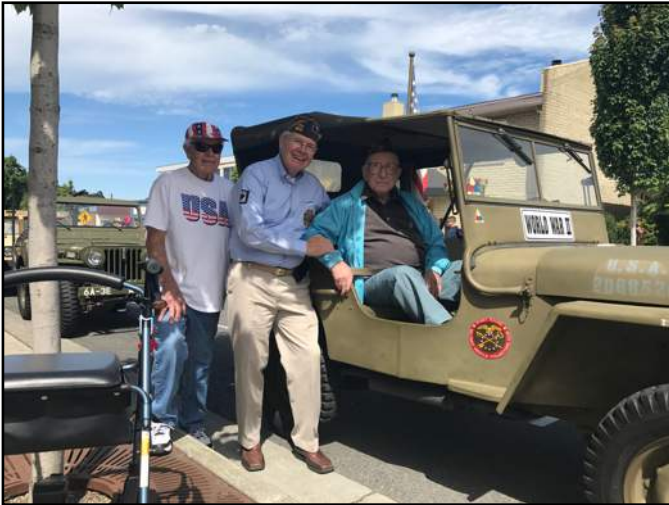
Forming up for the parade

Following the parade, our usual barbecue took place at the American Legion Hall, where our wonderful crew of set up people and grillmasters put together a terrific meal of hamburgers, hot dogs and appropriate salad, chips and drinks.