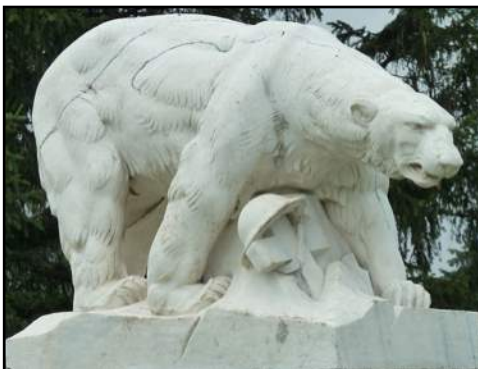
Polar Bear Monument, White Chapel, MI

The British regiment landed in Arkhangelsk, on the far northern tip of the Russian coast on August 2nd, 1918. The city held many supplies sent by the Allies to support the last Russian offensive against the Germans in 1917. Unfortunately, the supplies had already been seized by the Bolsheviks, who engaged the Allies in combat almost immediately upon their arrival.