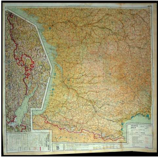
Map of France and Spain, with German/Swiss Frontier offset at

At that time, there was only one manufacturer in Great Britain that had perfected the technology of printing on silk, and that was John Waddington, Ltd. Coincidentally, Waddington was also the U.K Licensee for the popular American board game, Monopoly. As it happened, 'games and pastimes' was a category of item qualified for insertion into 'CARE' packages', dispatched by the International Red Cross to prisoners of war.