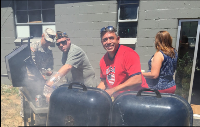
Cooking up a batch of burgers and dogs.

Comrades of Post 8870 and their families gathered after the parade to share some great food prepared both on site and brought from home.