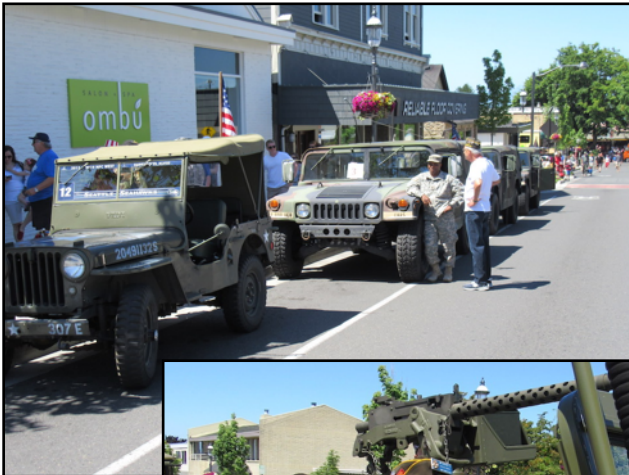
Edmonds Veterans and members of the Washington National Guard form up along Main St. before the parade.