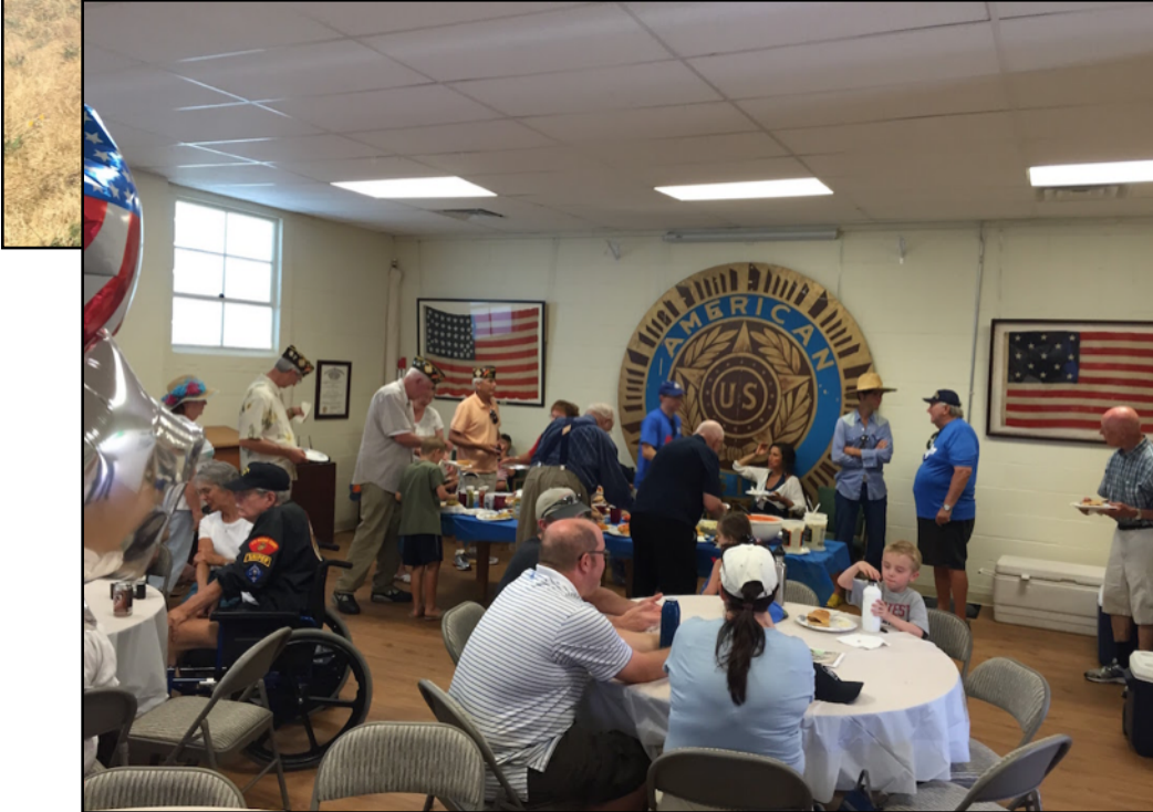
Post members and their families enjoy some traditional 4th of July fare.

A great opportunity to celebrate the reason we served.