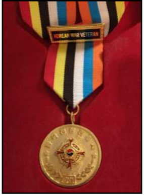
Korean Ambassador for Peace Medal

Six members of Post 8870 were among 23 Korean War veterans honored by Edmonds Community College at their annual Veterans Day celebration November 2. The event filled the college's Black Box Theater to standing room only.