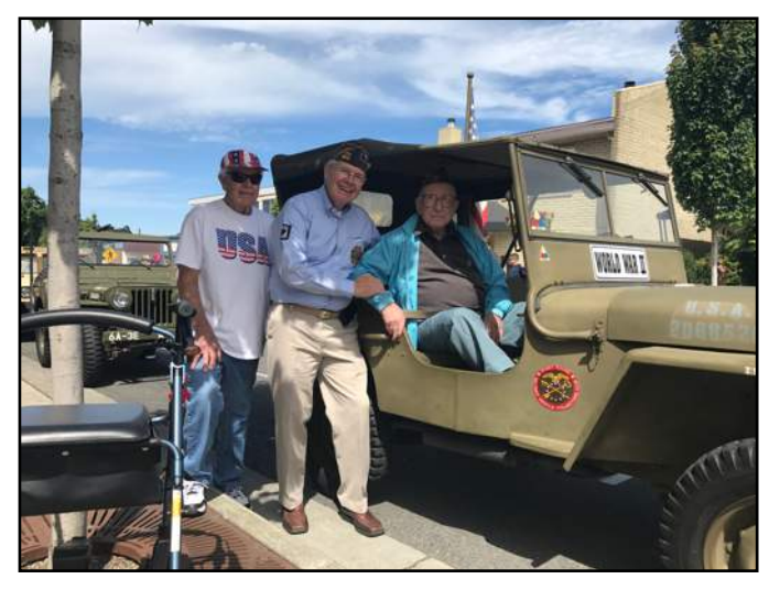
Forming up for the parade

Following the parade, our usual barbecue took place at the American Legion Hall, where our wonderful crew of set up people and grillmasters put together a terrific meal of hamburgers, hot dogs and appropriate salad, chips and drinks.