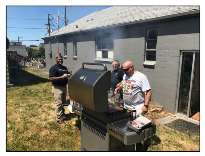
Three expert grillmasters hard at work on the barbecue