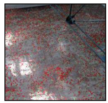
The Western front Poppy Field

In 2004, Congress named Liberty Memorial as the nation's official WW I Museum and construction began on an 80,000 square foot expansion underneath the original memorial. The present day museum is comprised of two sections. The first half of the museum is devoted to European involvement in the war from its beginning. The second half of the museum is devoted to the American experience.