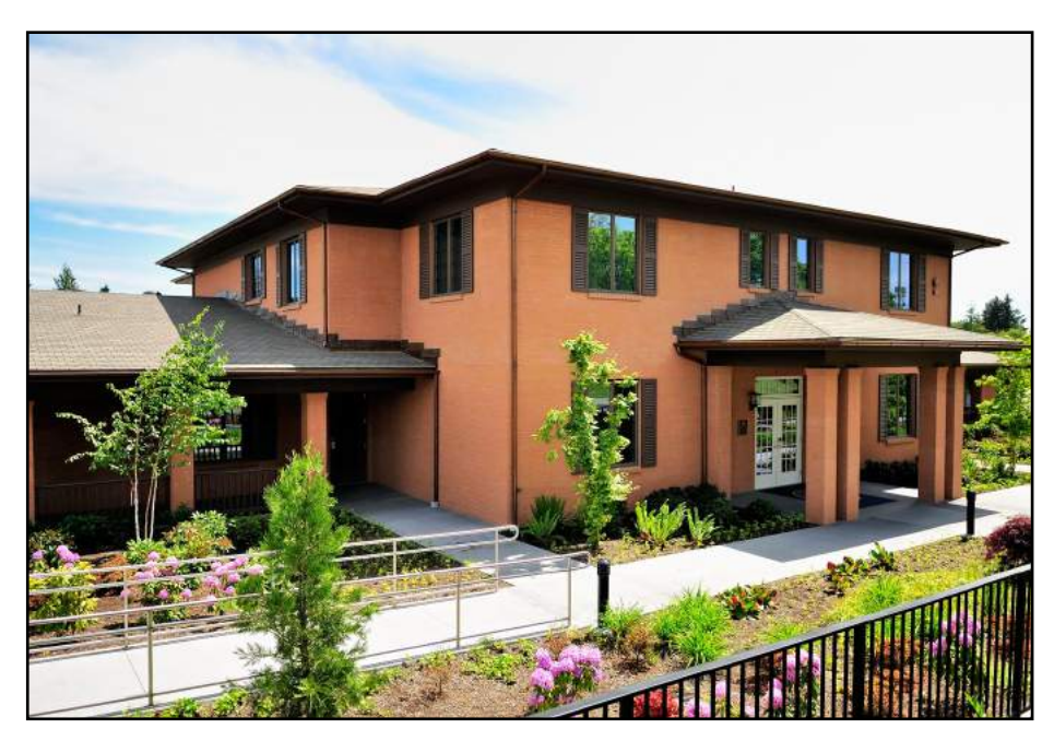
Puget Sound Fisher House is located at 1660 South Columbian Way in Seattle.

Puget Sound Fisher House is one of the organizations supported by the VFW Post 8870 Relief Fund.