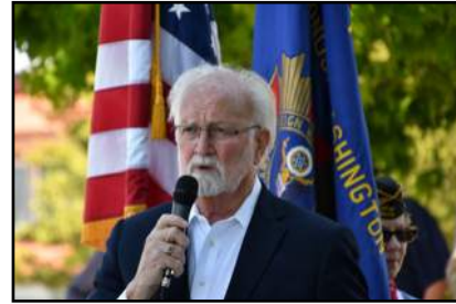
Edmonds Mayor David Earling

Stop by and take it for a test drive soon.