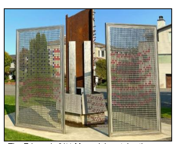
The Edmonds 9/11 Memorial contains the remains of a World Trade Center beam

Last Friday, Sept. 11, 2020 marked the 19th anniversary of the terrorist attacks that changed America forever. The memories of that day are still vivid and raw in our nation's heart, but the heroism that emerged from the rubble of the World Trade Center, the Pentagon, and in the air above a rural Pennsylvania field, should inspire Americans for generations to come. As we remember 9/11 and the nearly 3,000 innocent lives lost that terrible day, the VFW and Edmonds Post 8870, hope all Americans pause and reflect on those we lost and those who continue to sacrifice in the defense of freedom.