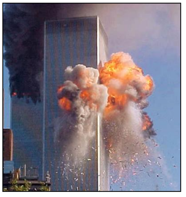
World Trade Center Tower Two is Struck on 9/11