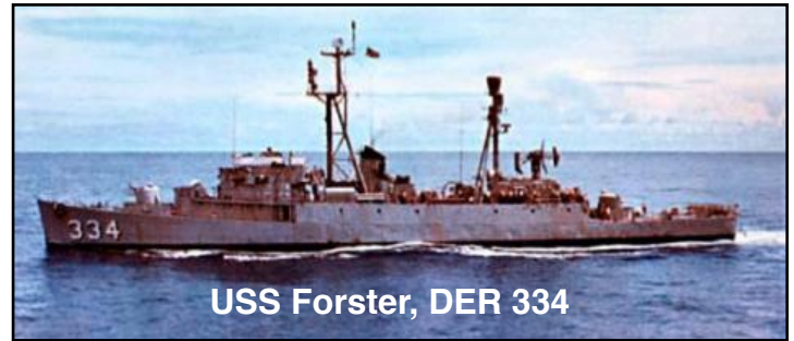
USS Forster, DER 334