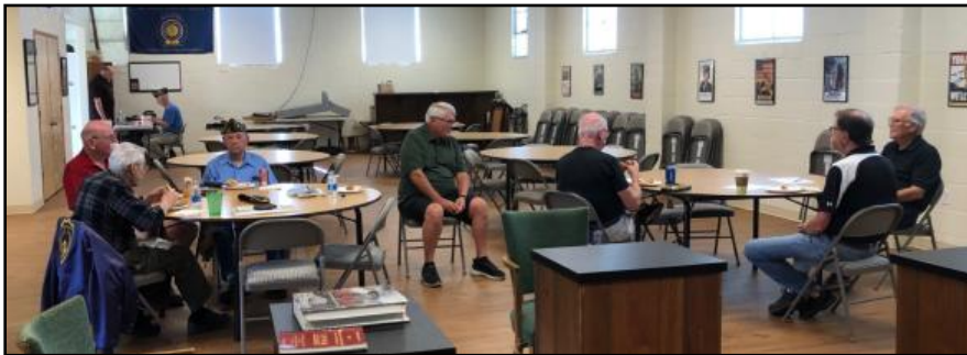
Early arrivals enjoy a meal prior to the meeting.

We had 14 Veterans present plus three attending by zoom.