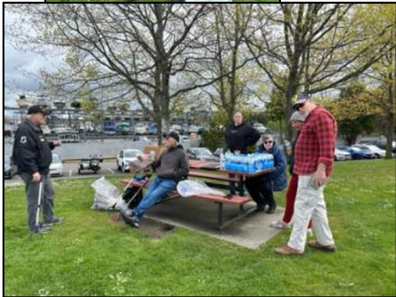
Taking a break in the action